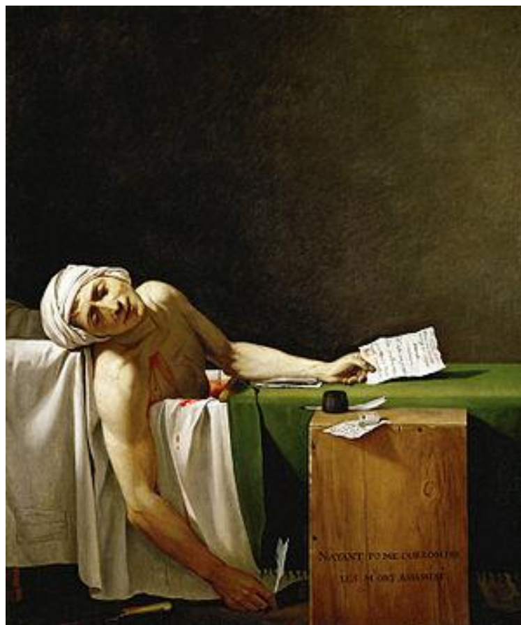
Jacques-Louis David, Death of Marat , 1793 (oil on canvas)