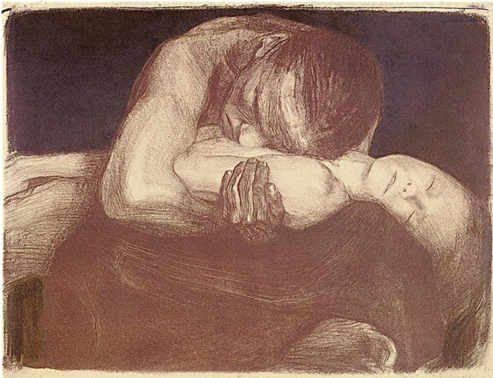
Kathe Kollwitz, Pieta , 1903 (lithograph)